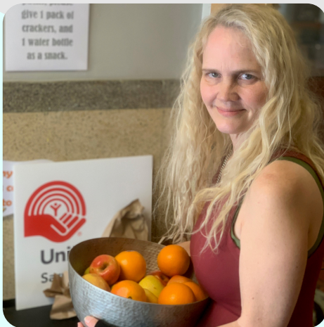
POVERTY TO POSSIBILITY