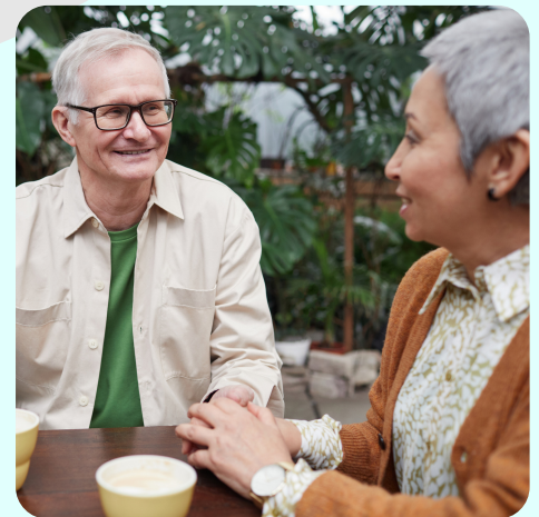
HEALTHY PEOPLE, STRONG COMMUNITIES

When you leave a gift to United Way in your will you are creating a lasting legacy for generations. You are able to leave bequests to your heirs and ensure your charitable choices continue.