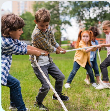
ALL THAT KIDS CAN BE